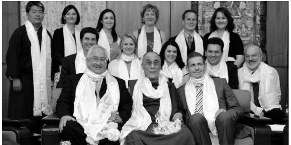
The All-Party Parliamentary Group