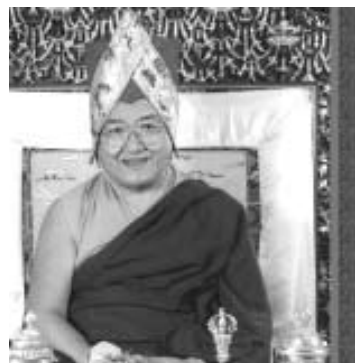
His Holiness the Sakya Trizin