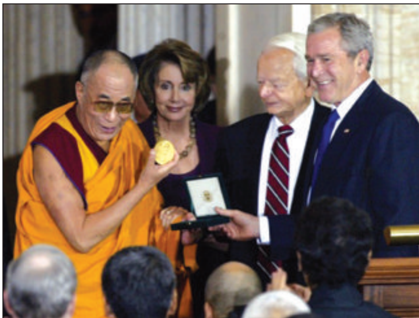
His Holiness the Dalai Lama receiving the US Congressional Gold Medal from President George W. Bush: 17 October 2007