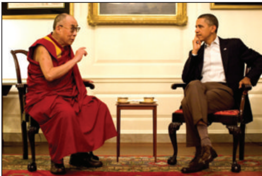
President Barack Obama with His Holiness the XIV Dalai Lama in the Map Room of the White House: 16 July 2011.