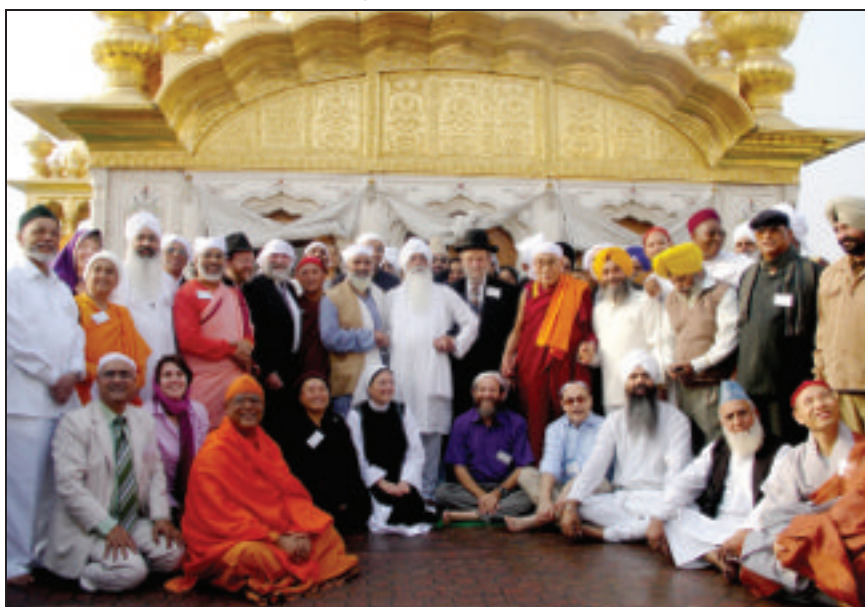
World religious leaders with His Holiness the Dalai Lama at the Golden Temple, Amritsar: 29 November 2007