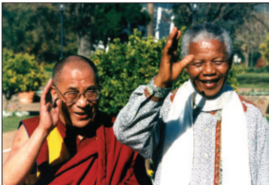
His Holiness the Dalai Lama with South African President Nelson Mandela: 22 August 1996