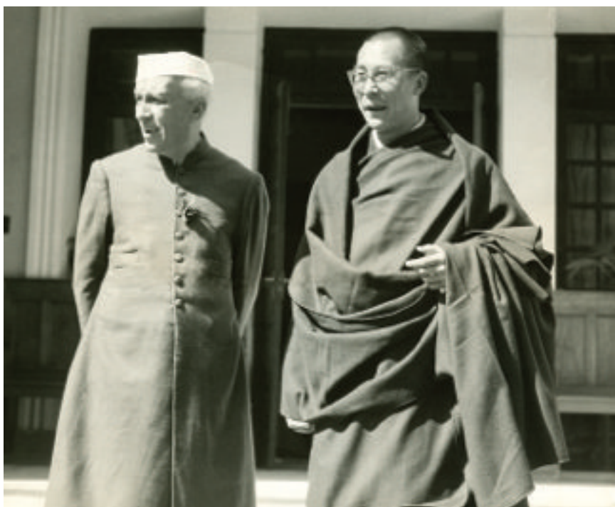
His Holiness the Dalai Lama, newly arrived in exile with India's Prime Minister Jawaharlal Nehru: 1959