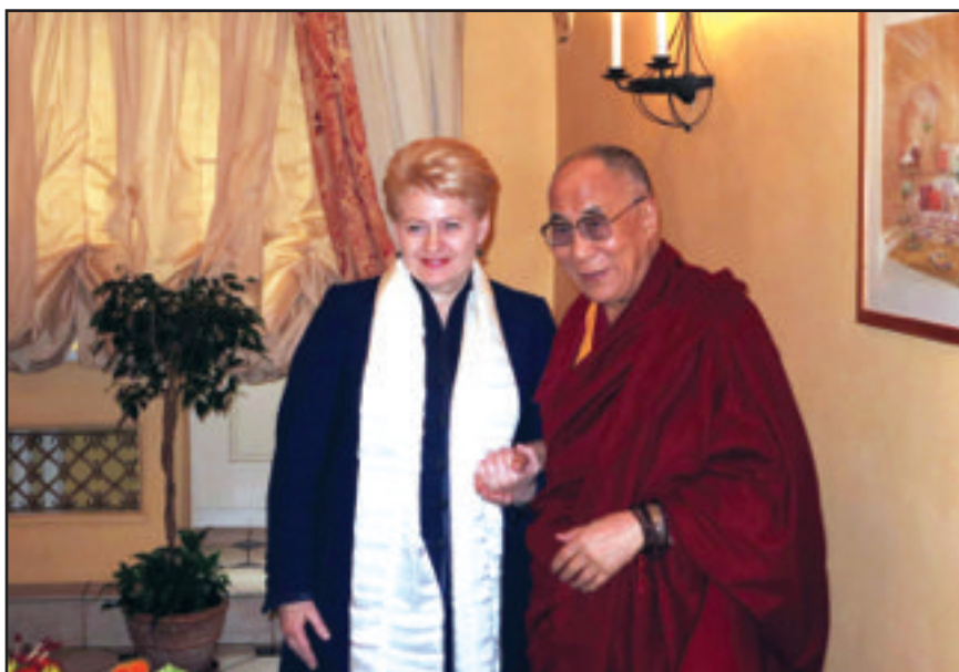
The President of Lithuania, Ms Dalia Grybauskaitė, with His Holiness the Dalai Lama in Vilnius, Lithuania: 11 September 2013