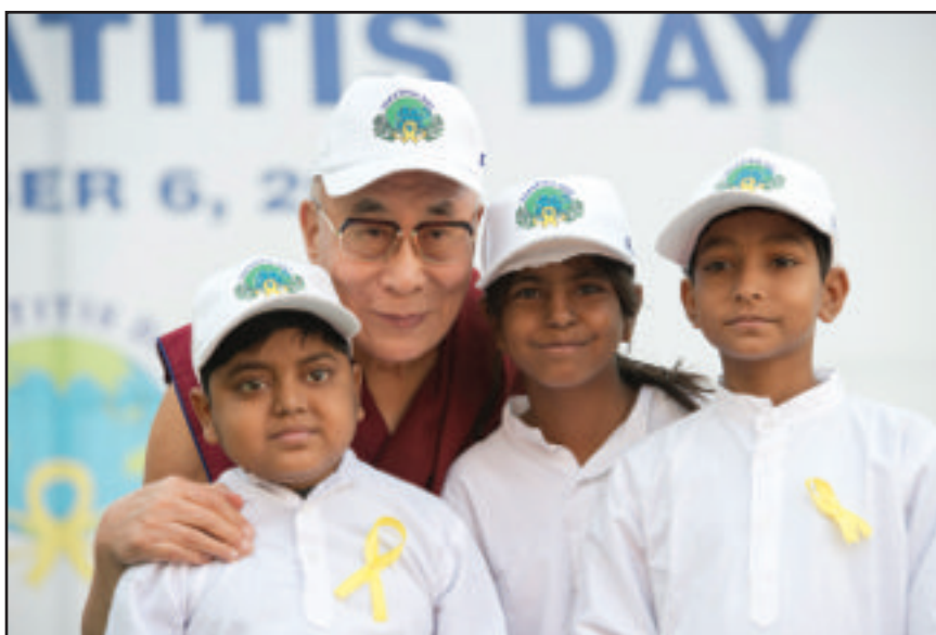
His Holiness with three young liver transplant patients in New Delhi, India: 6 December 2013.