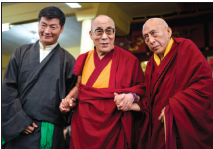
His Holiness the Dalai Lama with Sikyong Dr. Lobsang Sangay (left) and former Kalon Tripa Professor Samdhong Rinpoche (right) at the former's oath-taking ceremony: 8 August 2011