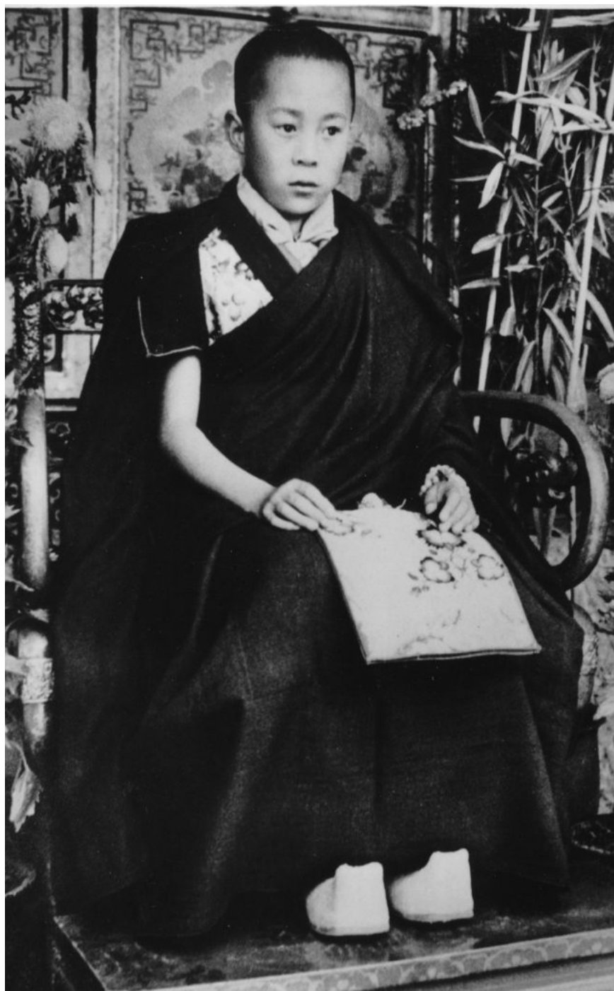
A formal portrait of His Holiness aged nine: Lhasa 1944