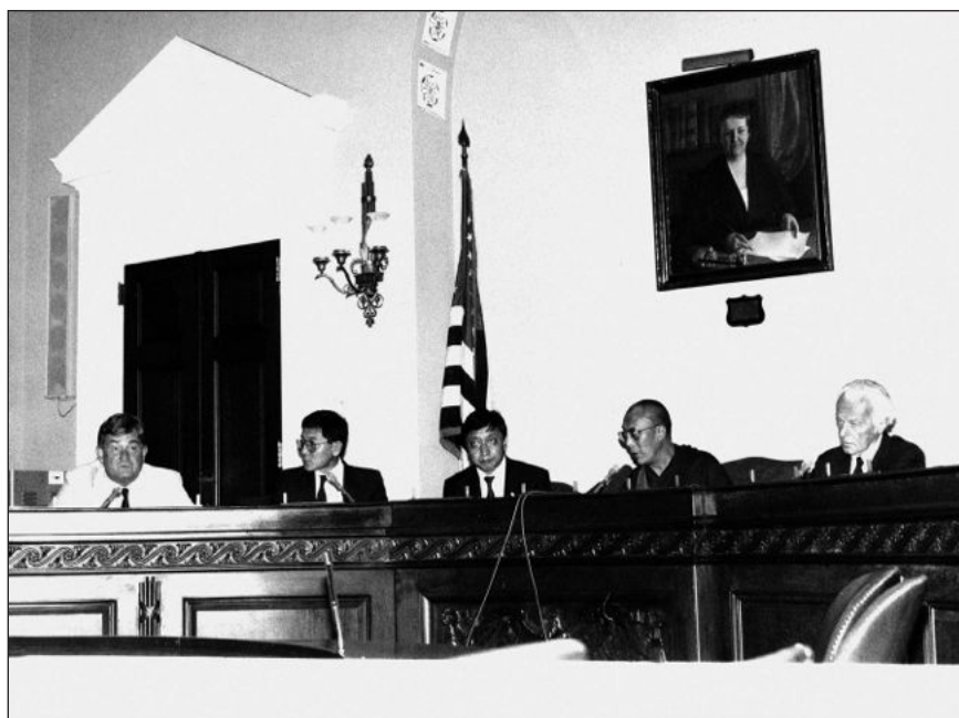
His Holiness the Dalai Lama outlining His Five-Point Peace Plan for Tibet to members of the United States Congress's Human Rights Caucus: 21 September 1987