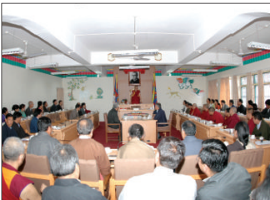
His Holiness the Dalai Lama addressing members of the 13th Tibetan Parliament-in-Exile: Dharamshala, India, 2004