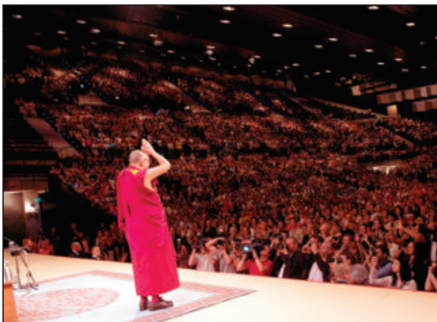
His Holiness the Dalai Lama greeting the audience at the Vienna Stadthalle before his talk 'Beyond Religion - Ethics for the Whole World' in Vienna, Austria: 25 May 2012.