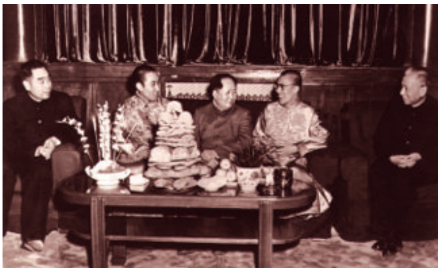
(L-R) Zhou Enlai, the Tenth Panchen Lama, Mao Zedong, His Holiness the Dalai Lama and Liu Shaoqi during the tour of Communist China: 1954-55